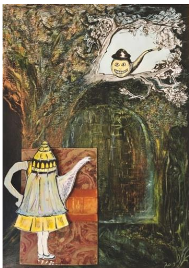
'Alice Renaissance' ©BFK2019